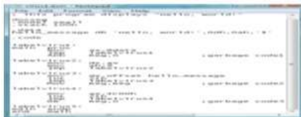
Figure 1: Assembly code of Virus File

The mutating behaviour of metamorphic viruses is due to their adoption of code obfuscation techniques like dead code insertion, Variable Renaming, Break and join transformation. Figure 1 shows the assembly file of the virus code. Computer viruses like polymorphic viruses and metamorphic viruses use more efficient techniques for their evolution so it is required to use strong models for understanding their evolution and then apply detection followed by the process of removal. Code Emulation is one of the strongest ways to analyze computer viruses but the anti-emulation activities made by virus designers are also active [4][5][6][7][8].